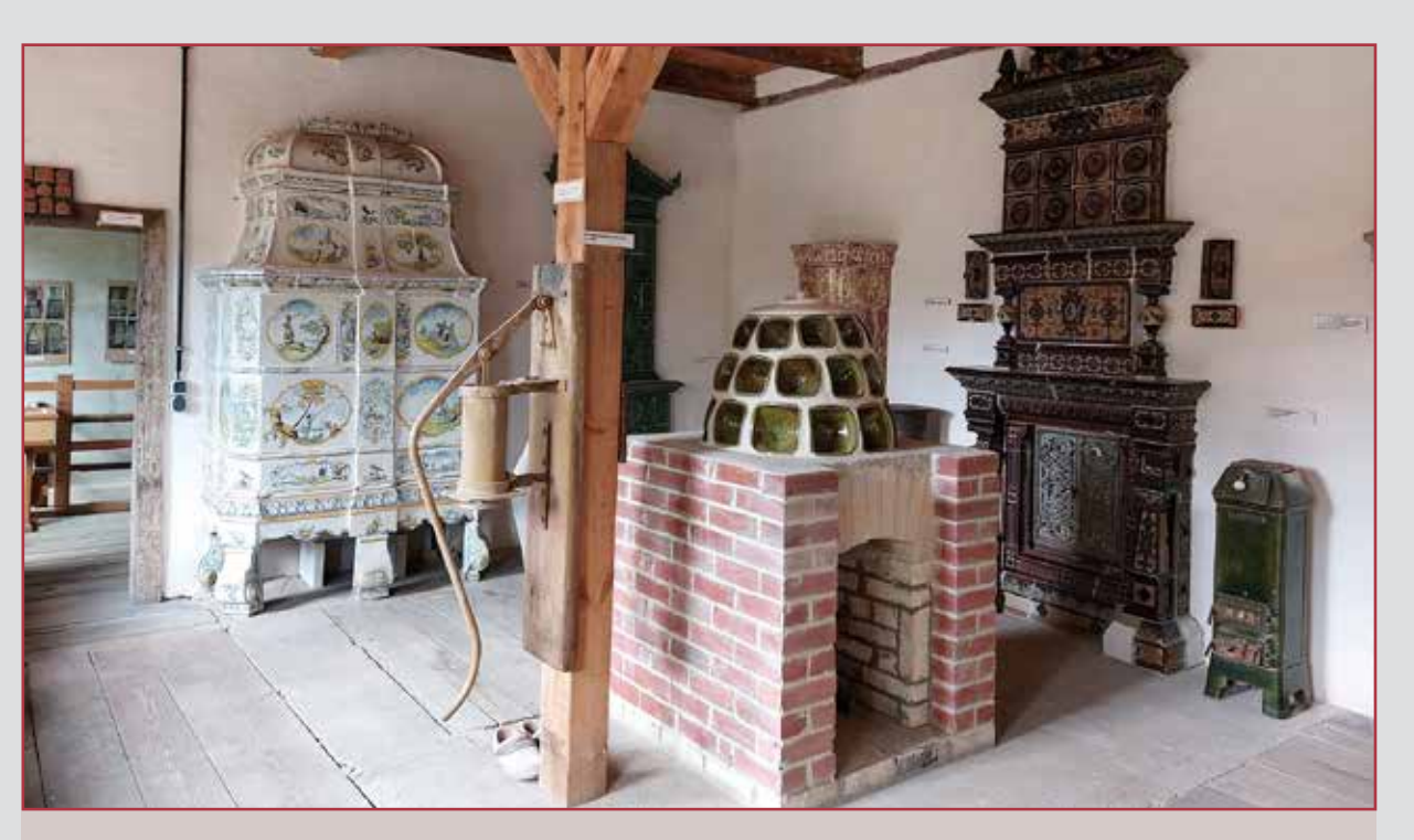
Collection of various show stoves dating from 1700 to 1990