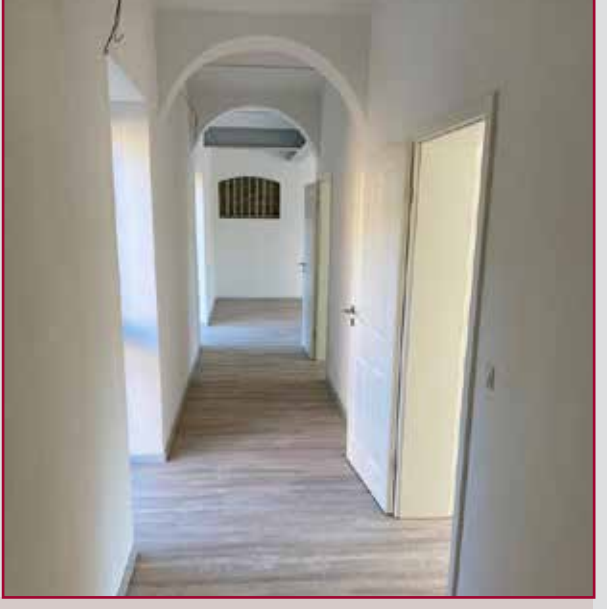
Corridor in the "Old Prison" before and after the conversion in 2021