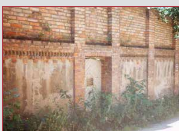
The old prison was surrounded by high walls