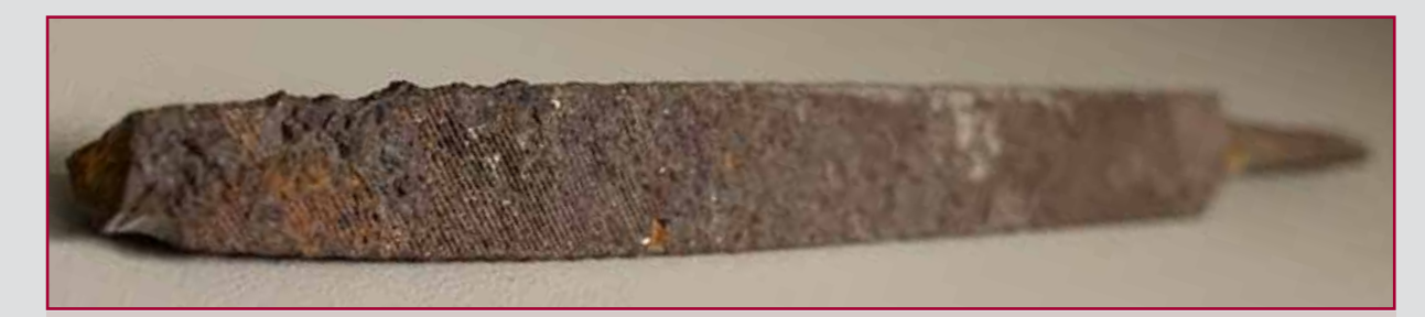
This arrow was found in an old cell during the building works. It was quite likely intended to be used as a means of escape.