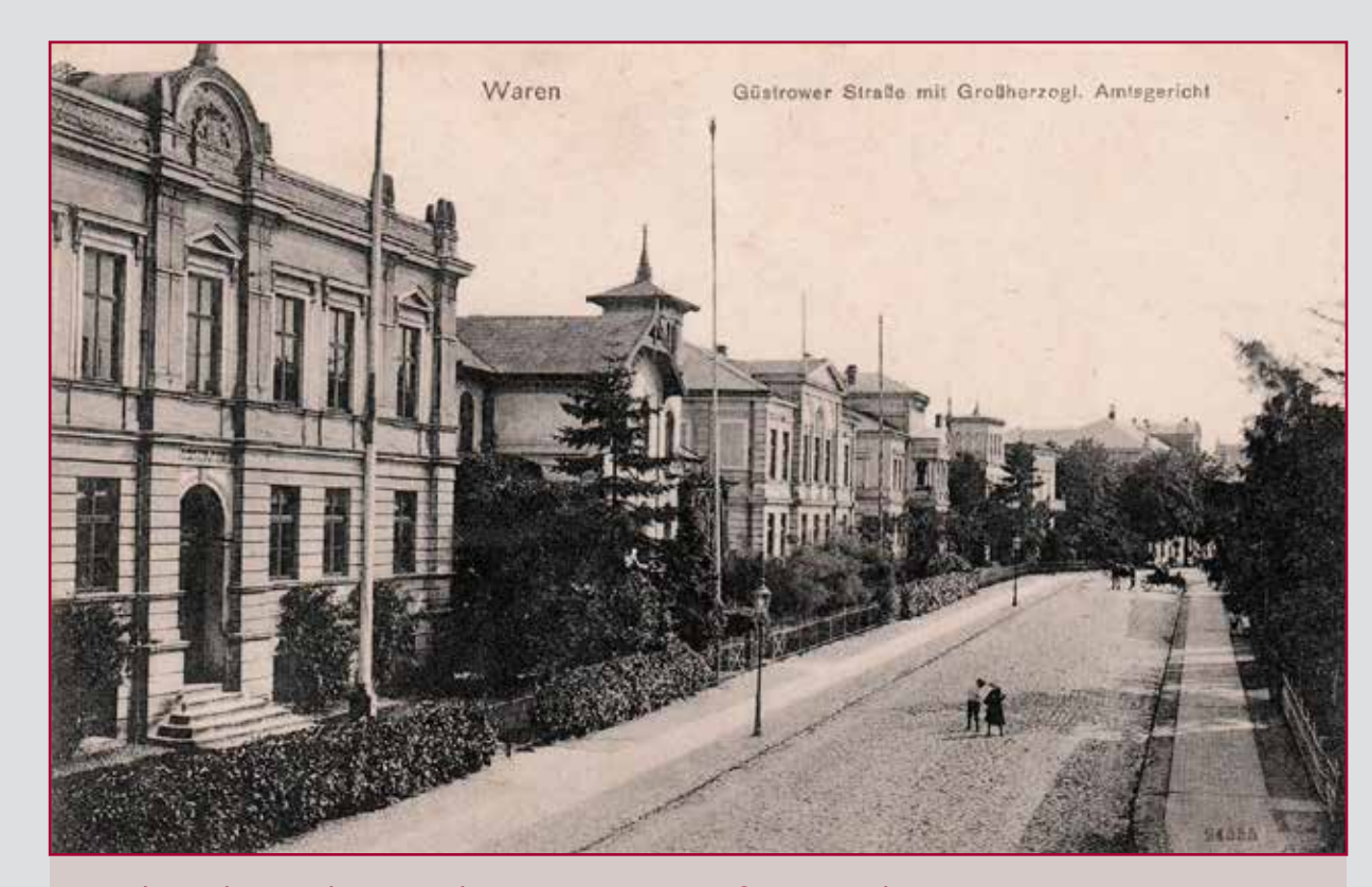
Looking down what is today Güstrower Straße around 1910