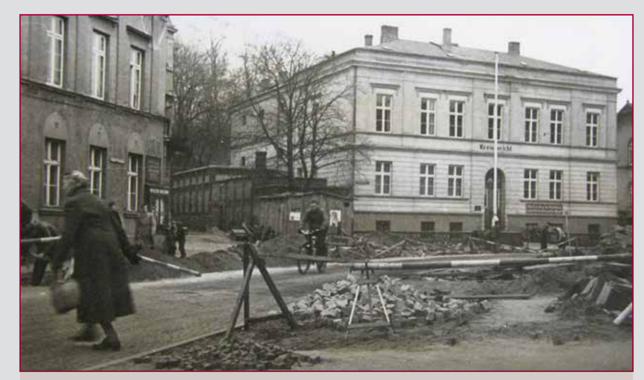
View of the courthouse around 1958

The district court building receives a fresh coat of plaster. The façade and roof are also simplified. The semi-arch adorning the top of the central risalit with the coat of arms of Mecklenburg disappears, as does the Lady Justice that was stood atop it. The house is coated with an ivory shade of lime sandstone. The iron fence running along Güstrower Straße is scrapped and replaced by a lower fence.