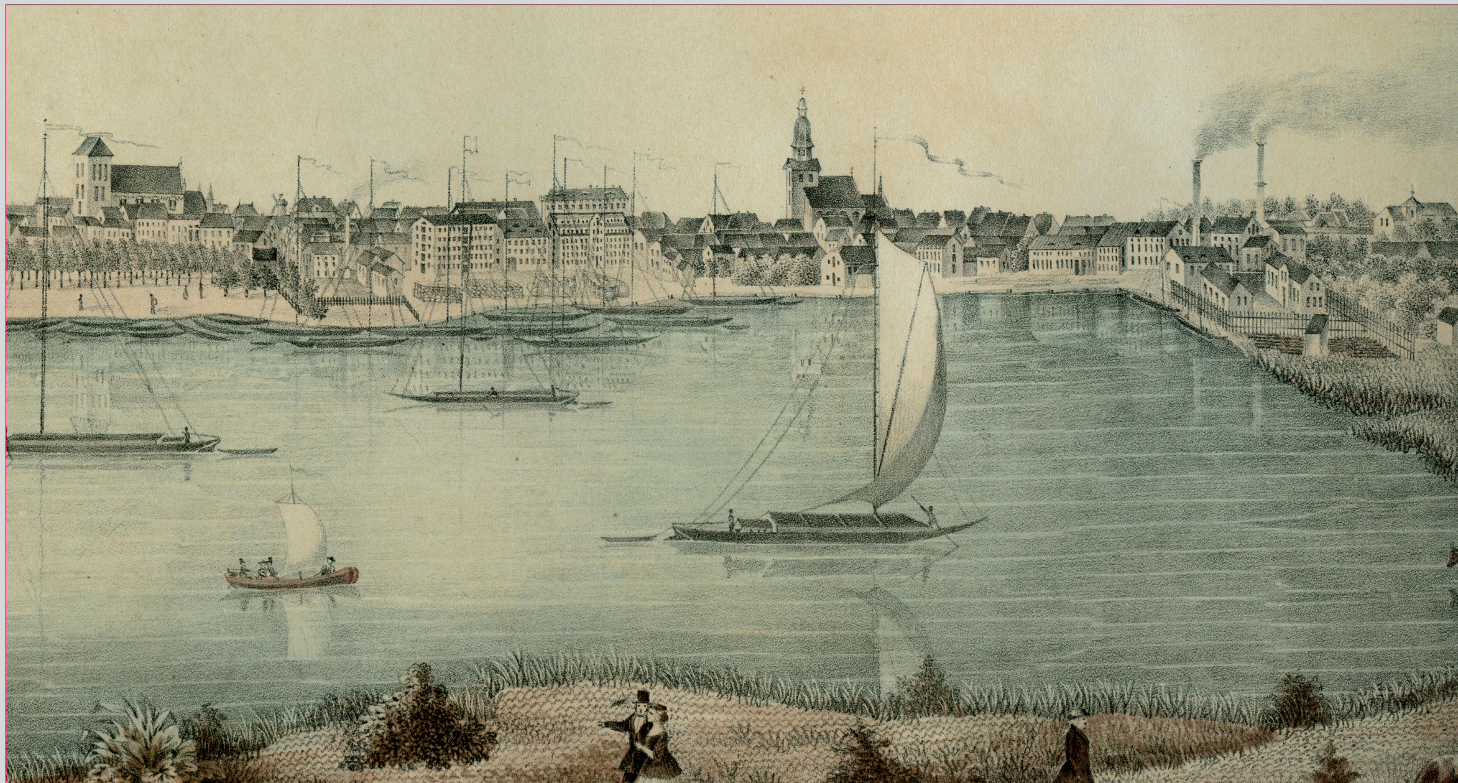
▲ The skyline of Waren is still dominated by its two major churches.