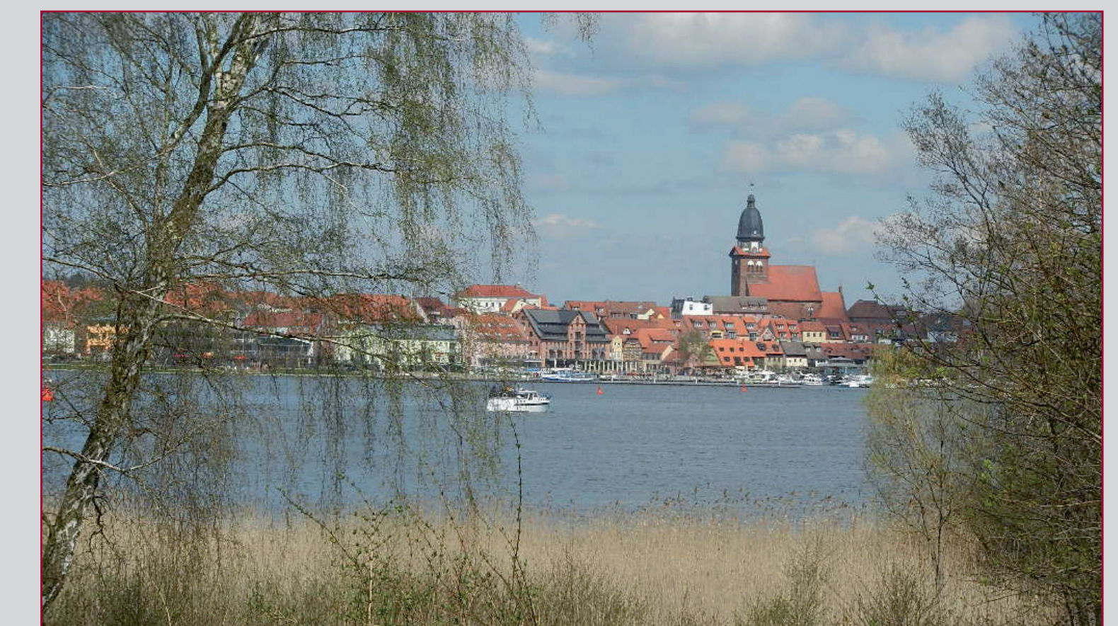
▲ Waren skyline 2012

It was none other than writer Theodor Fontane who lauded the Town of Waren and its surrounding area among his acquaintances in Berlin, thereby helping to promote the town. This is the view of the Town of Waren that still greeted him in 1896 when he summured in Ecktannen on the southern shore of Binnenmüritz lake.